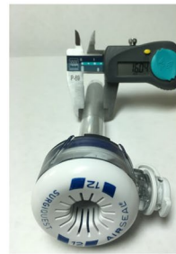
12-mm Airseal® Access port (x1)