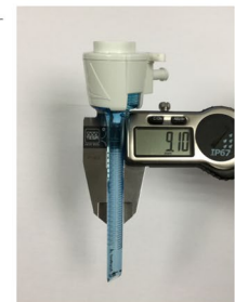
5-mm laparoscopic assistant port (x2)