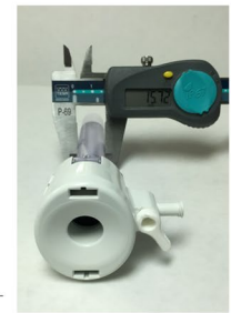
12-mm laparoscopic port (x2)