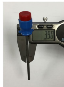
3-mm mini-laparoscopic port (x3)